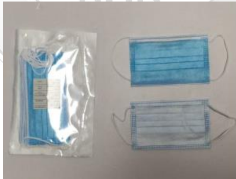
Photo of Samples

Note: Pass = Meet customer requirements; Fail = Fail customer requirements; # = No comment; N.D. = Not detected.